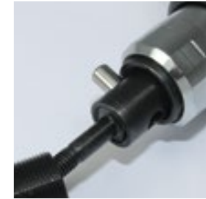
Quick change system for the mandrel