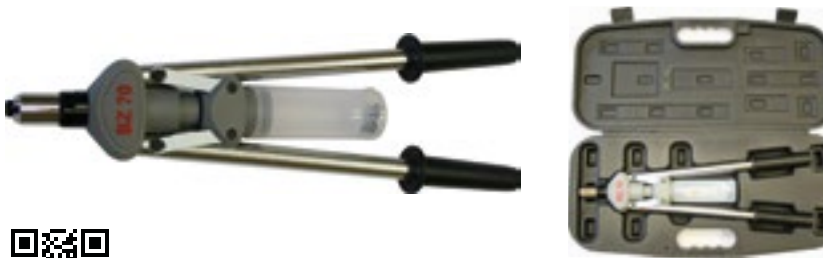
Lever tool BZ 70 in impact-resistant plastic case