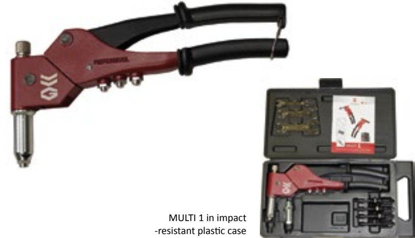
MULTI 1 in impact-resistant plastic case

Hand Tool for Blind Rivets, Blind Rivet Nuts and Blind Rivet Bolts > 360° pivoting head