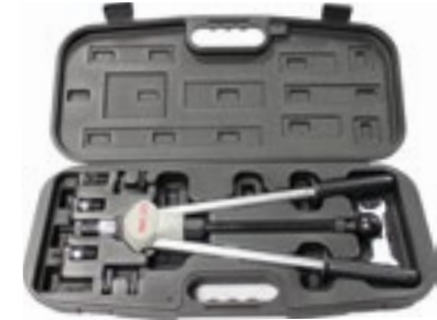
VNG 371 in impact-resistant plastic case