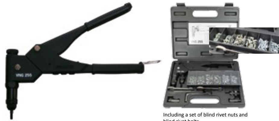
Including a set of blind rivet nuts and blind rivet bolts