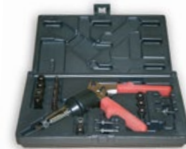
VNG 152 in impact-resistant plastic case