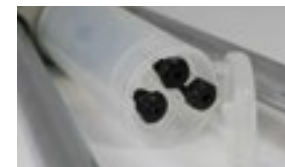
Replacement nose piece in locked box integrated in mandrel container