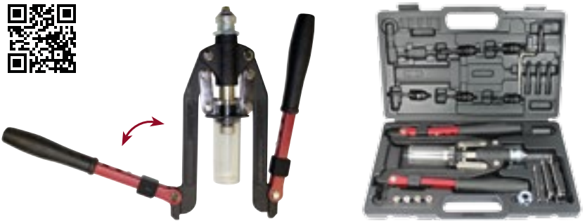
Multi 5 with folded-in arms in impact-resistant plastic case.