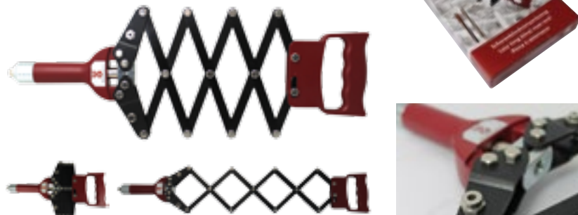
Replacement nose pieces inserted in the tool