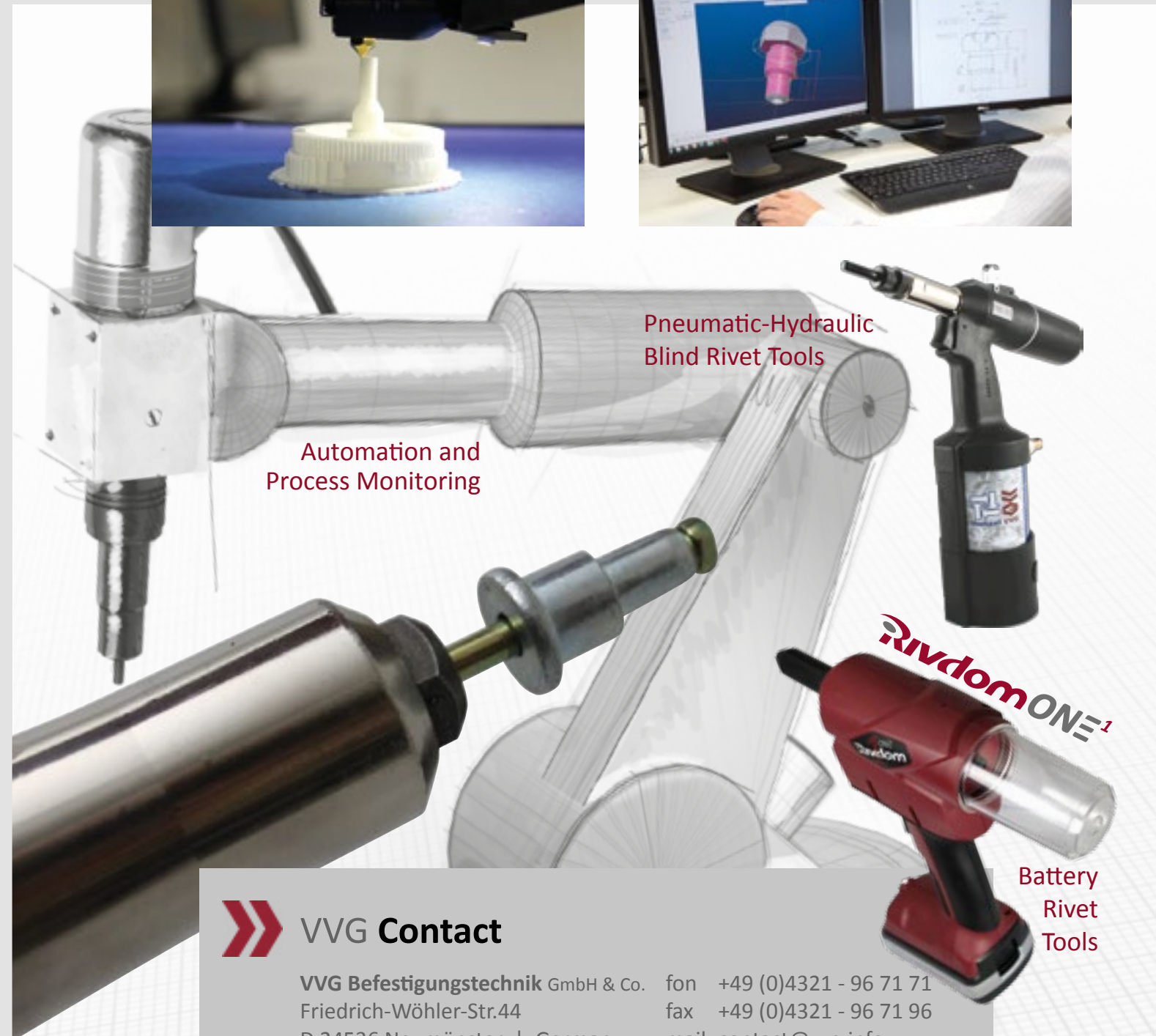
Pneumatic-Hydraulic Blind Rivet Tools