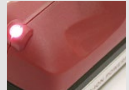
LED lighted drill hole