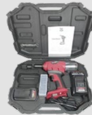
Sturdy plastic case with metal locks and space for two batteries.