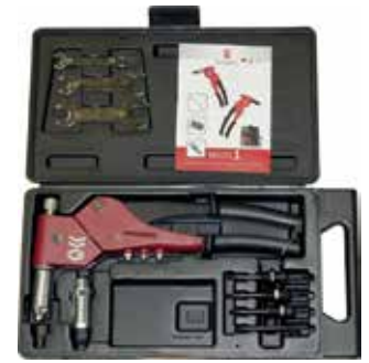
MULTI 1 in impact-resistant plastic case.