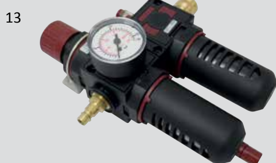
Maintenance unit G3/8, 2-part, including plastic protective cage, fastening angle, plug connection G3/8, coupling and 1 litre of pneumatic motor oil.