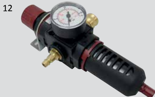
Filter regulator G3/8 with filter-pressure regulator, manometer, plastic protective cage, fastening angle, plug connection G3/8 and coupling.

For smooth operation of our pneumatic tools please note implicitly the information in our operating manuals! Important for preserving performance and to avoid damages are the characteristics of the used compressed air . Water condensation compromises the lubrication and causes corrosion inside the tool! The motors need to be greased continuously! We recommend implicitly the use of maintenance units for clean and greased air (VNG) or filter-pressure reducers for clean and dry air (BZ)!